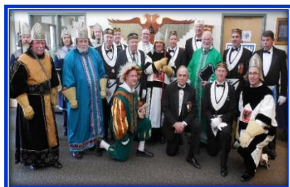
...to be Brothers